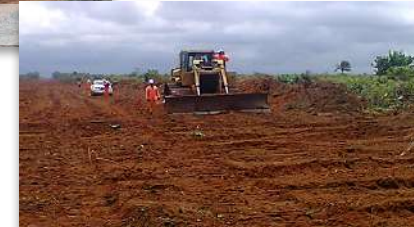
Act 2 - R.O.W. Clearing