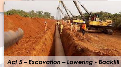
Act 5 – Excavation – Lowering - Backfill