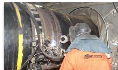
Act 4 – Pipe Welding