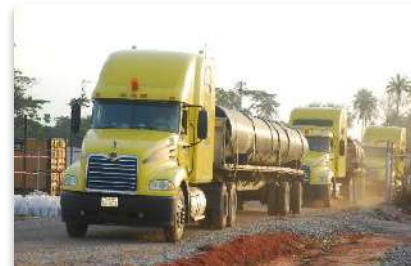
Act 1 – HAULAGE