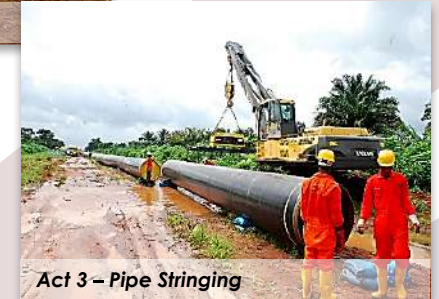
Act 3 – Pipe Stringing